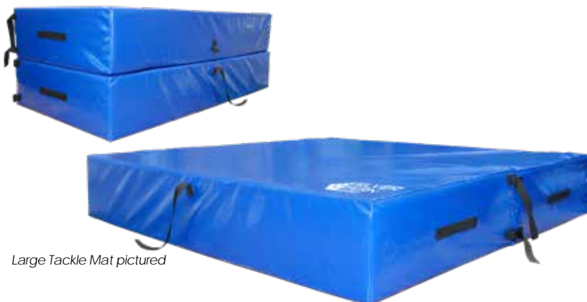
Large Tackle Mat pictured